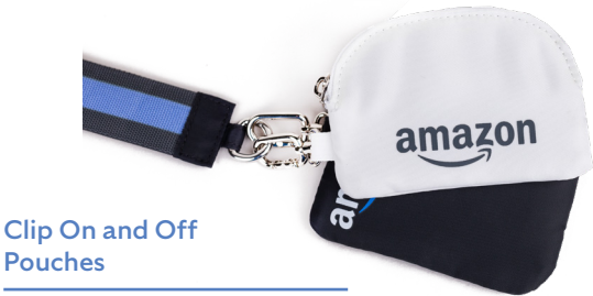
Clip On and Off Pouches